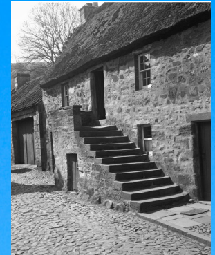
A thatched roof