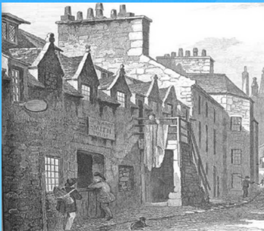
Print of a 17th century house or tavern