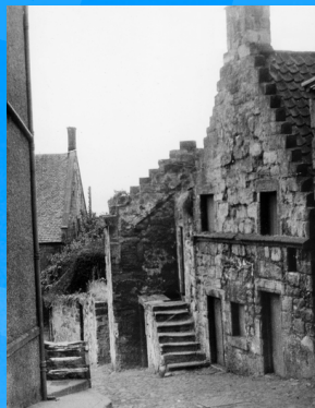
A 'crow stepped gable' on your roof