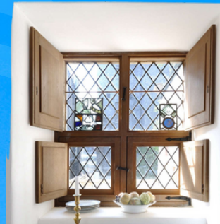
Windows or shutters