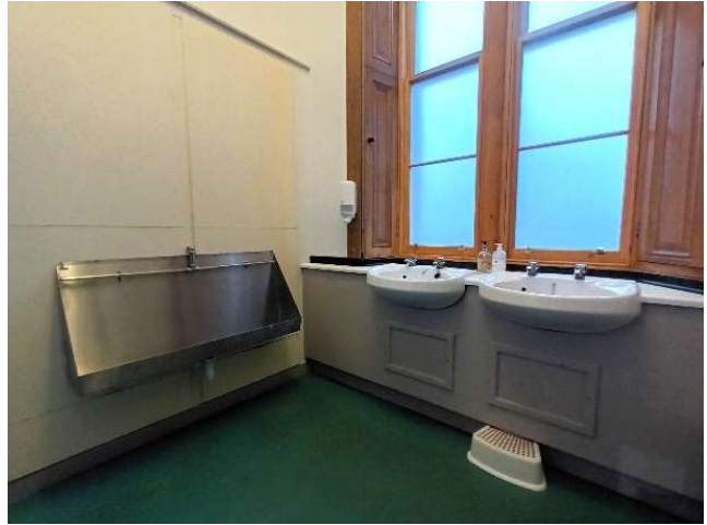
Pictured: Ladies toilet (left) Gents toilet (right)