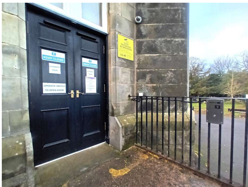
Pictured: Accessible Entrance and Intercom