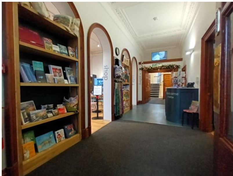
Pictured: Shop interior with access to café on the left

Our staff are available to assist customers who require merchandise from the higher shelves.