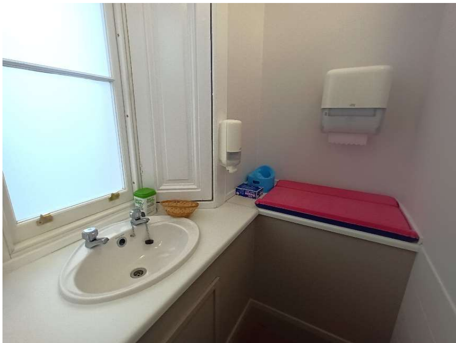
Pictured: Baby changing area