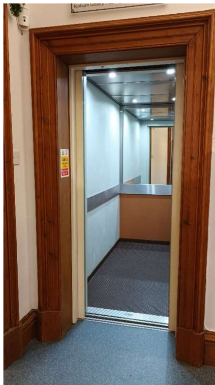
Pictured: Lift door and interior.