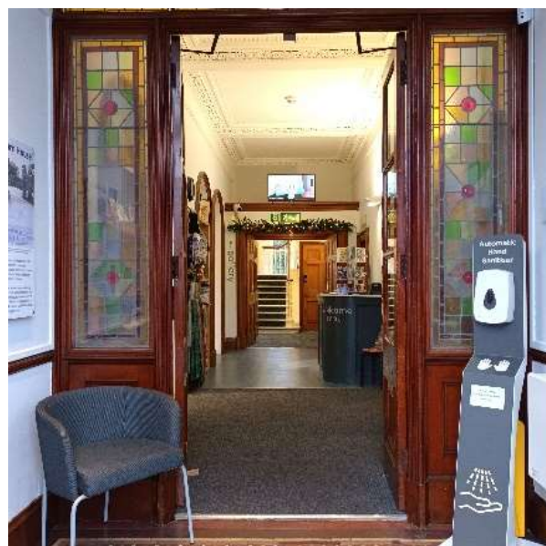
Pictured: Main Entrance with steps and hand rail and Main Entrance Lobby