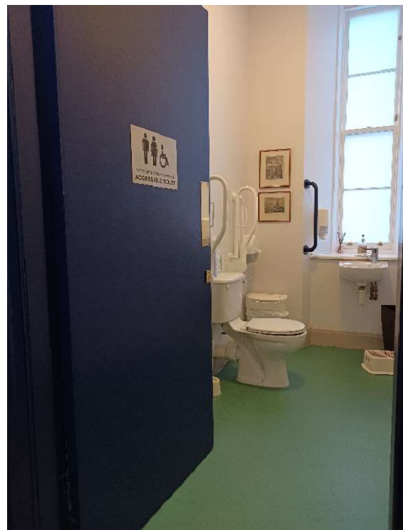
Pictured: Accessible Toilet Access