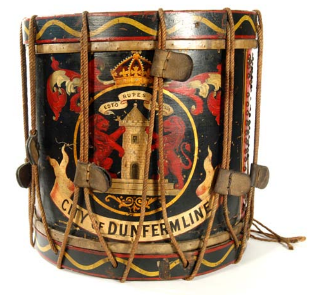
Beat the drum for Dunfermline! Town drum used by the town crier when announcing the news