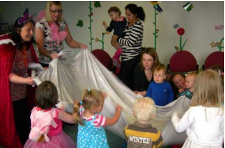
Pre-schoolers and their parents being consulted at a Bookbug session